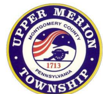
BANNER DESIGN EXAMPLE

For questions or more information on the Upper Merion Township Hometown Heroes Banner Program, call the Township Administration Office at 610-265-2600 x1229 or email gvattimo@umtownship.org .